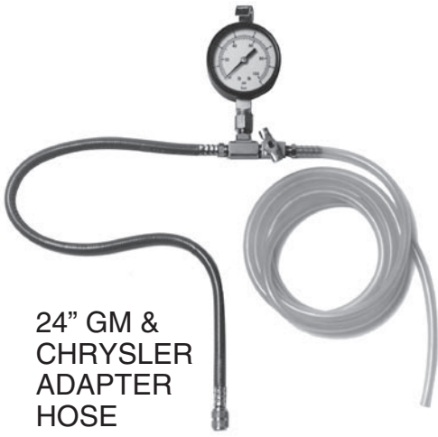
24" GM & CHRYSLER ADAPTER HOSE