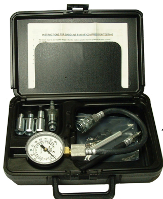
33875 Molded Storage Case