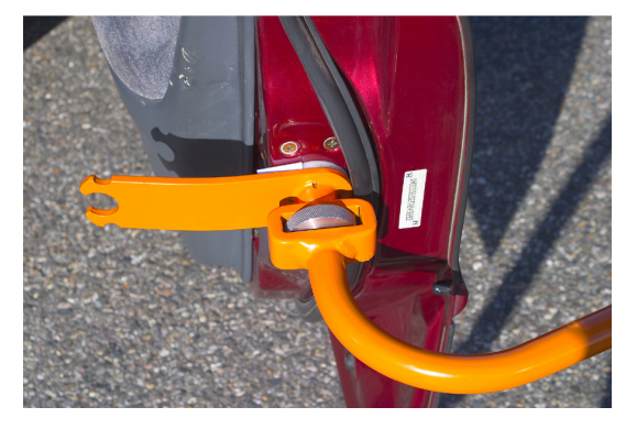
Open vehicle door. Slide Insert Pin into the open door latch until it completely locks.