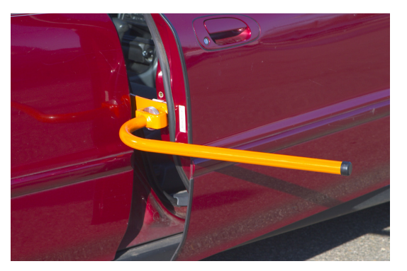
Gently move the handle up or down to adjust the door to the desired position.

Remove the Door Aligner Tool by (1)opening the door, (2)turning the Knurled Drive Nut counterclockwise, (3)opening the door latch and (4)sliding the Insert Pin out of the door latch.