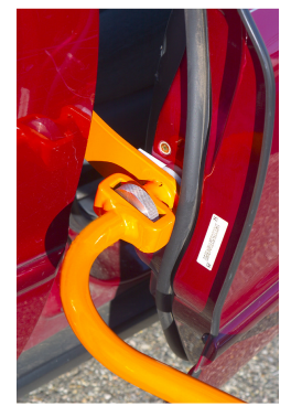
Move the door towards the door jam and rest the Alignment Bar on the door catch (You can use the center opening or either notch on the Alignment Bar).