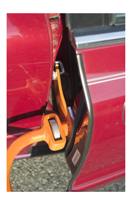
Rotate Knurled Drive Nut clockwise until the Heel is flush with the door. Do not over tighten.